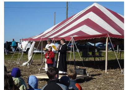
Some Photos from the Groundbreaking here at Christ Lutheran in 2006