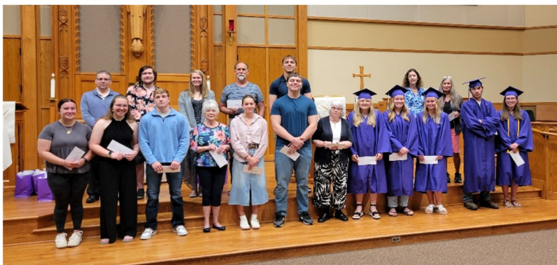
2024 Scholarship recipients and/or the people that represented them during our Baccalaureate service on May 26th.