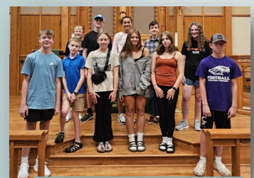
7th through 8th Grade