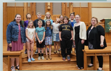
3rd through 4th Grade