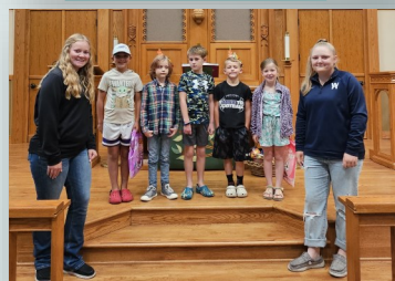
1st through 2nd Grade