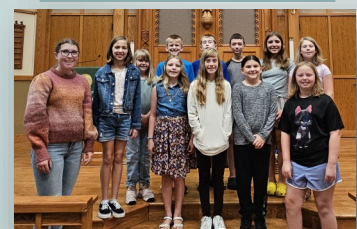
5th through 6th Grade