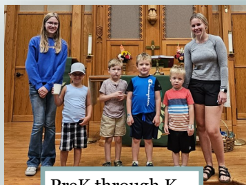
PreK through K

Sunday School Classes from the first week of the 2023/2024 School Year. We want to thank students and teachers for your participation in this year's program!